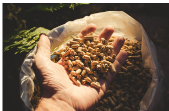
Wood pellets are a common fuel in wood heating systems.

The measurements revealed that the emission of pollutants is much lower in the case of automatically operated wood combustion systems than for manually operated systems – depending on the setting, between three and 2,400 times lower. Not only this: manually operated furnaces also produced so-called secondary organic aerosols that are first formed in the atmosphere upon reacting with sunlight. For a wood furnace, these can reach high levels during the start phase and more than double the overall volume of particulate matter. However, under poor conditions, such as a lack or surplus of air, or during the start phase, automatic combustion systems also emit a similar level of pollutants. A low level of pollutant emissions can therefore be achieved