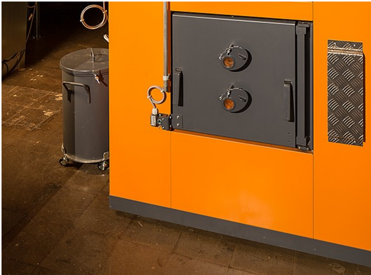
With automatic combustion systems, energy can be generated from wood without the air being heavily polluted.