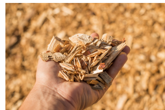
Wood chips allow for clean burning.

To this end, they examined nine different types of combustion system, including both automatic and manual variants. In doing so, the scientists varied the operating conditions and the fuels used, allowing them to measure a total of 51 combinations. In addition to normal operations, the different operating conditions included cold and warm starts as well as operations with a lack of air. The fuels included wood pellets, wood chips as well as dry and damp pieces of beech.