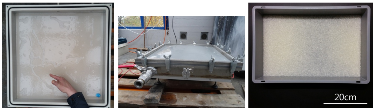
The production of the improved silica gel: from the suspension (left) through to the drying process and the product itself, the silica beads. Empa

The researchers initially optimised the synthesis of silica sorption materials. They mixed an aqueous suspension comprising silicic acid and silicon dioxide with an ammonia solution. The mixture was subsequently gelled and dried at 65 degrees Celsius. In various experiments, the researchers now varied the concentration of the substances used and recognised that they could thus control the size of the particles produced and the pore size in their surface – both characteristics that determine a material's sorption properties. In this way, the materials researchers created a material that performs better than its commercial counterparts, especially in scenario 4.