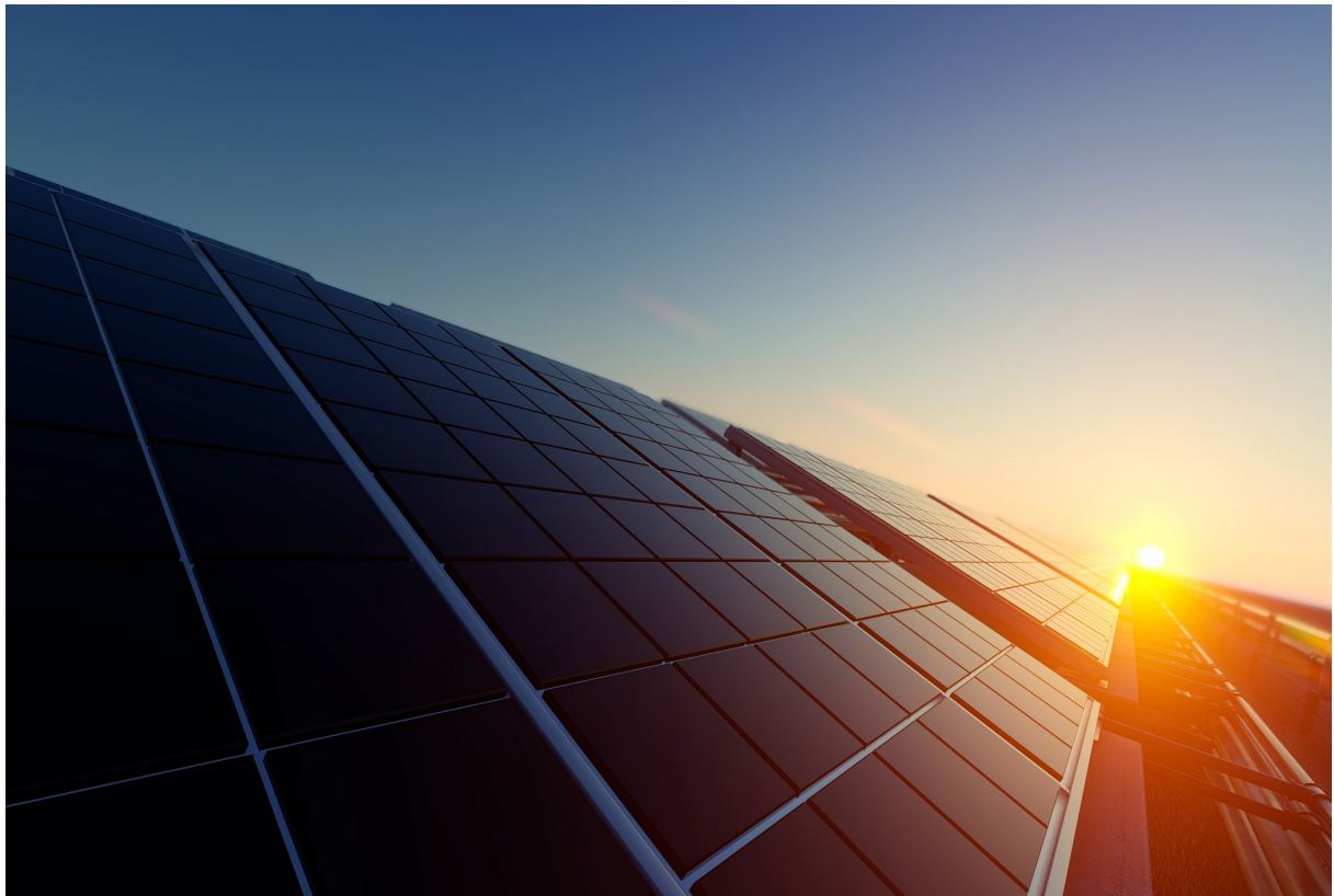
Photovoltaic systems could help decentralize energy generation

Decentralised renewable energy systems could drive the energy transition forward. In future, rural areas in particular could cover most of their energy needs on their own.