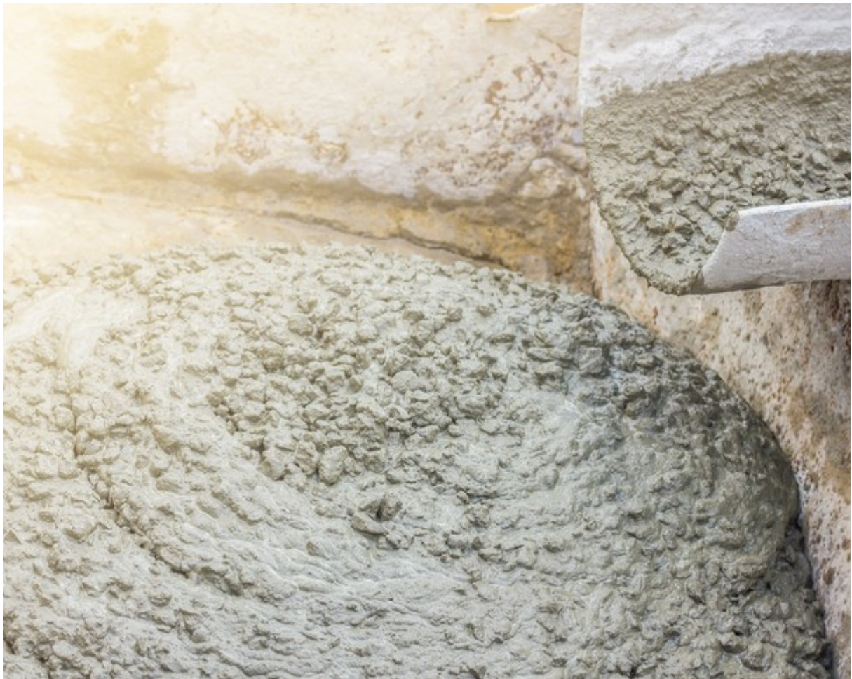
Texture from ready-mix concrete cement mortar.

Worldwide, no material is produced as much as concrete. This is an energy-intensive process and causes CO 2 . A new type of concrete with less cement is more environmentally friendly.