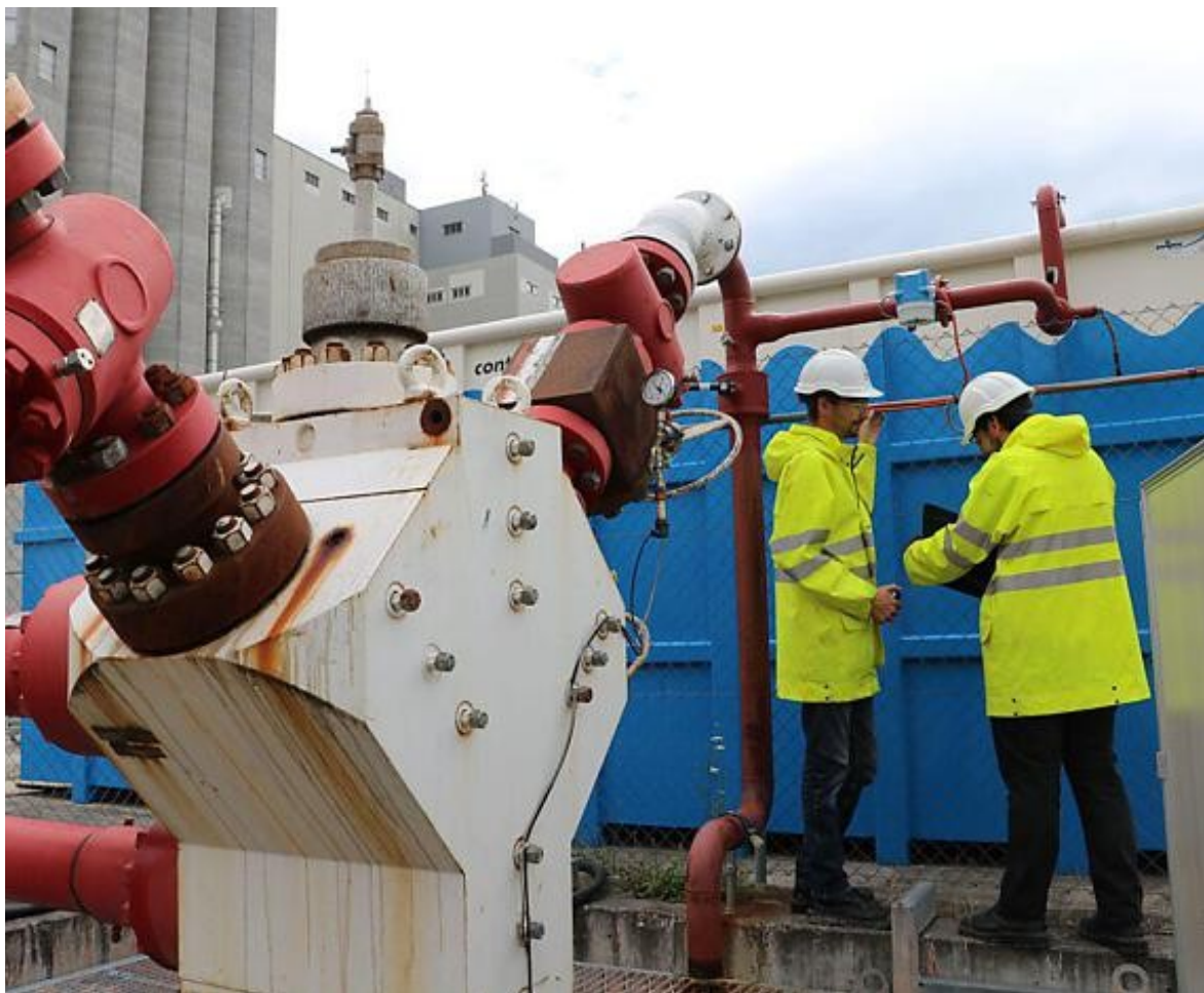
The borehole remains unused for the time being – the Basel pilot project for the geothermal generation of electricity and heat was discontinued due to earthquakes.

Extracting geothermal energy from deep layers of rock and producing electricity – while the idea is so enticing, its implementation is complicated. Two attempts at tapping deep geothermal energy in Switzerland as a clean source of energy have had to be discontinued due to earthquakes. Virtual computer-based test facilities should now allow for the secure and targeted development of this technology.