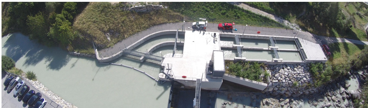
Die Entsandungsanlage Wysswasser bei Fiesch im Kanton Wallis.

Large alpine hydropower plants are the backbone of Swiss electricity production. The Energy Strategy 2050 aims to further increase their efficiency, but small particles in the water, i.e. sediments, stand in the way of this goal. Fine sediments carried by rivers act like sandpaper on the turbines of power plants and obstruct them. This problem is well known and power plants operate desanding facilities designed to reduce the suspended load. These systems consist of elongated basins in which the water flows very slowly, allowing the particles to settle on the bottom. But even the latest generation of these facilities only partially fulfil their purpose. For this reason, turbines require more frequent maintenance work, causing electricity production downtime and financial losses. In Switzerland alone, annual costs are estimated at approximately 6 million Swiss francs.