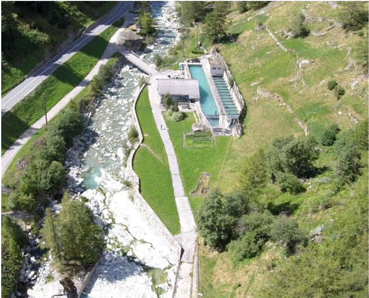
Before water can drive turbines, it must pass through desanding facilities: a plant near Saas-Balen in the canton of Valais

Despite desanding facilities, the water that drives power plant turbines still contains sediments, causing damage to the infrastructure as well as production losses. Researchers have now optimized these facilities and developed new design guidelines.