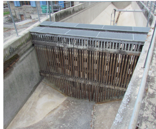
Rakes in the basins calm the water flow and contribute to efficient desanding.

The researchers also studied the impact of the geometry of the basin. They were able to demonstrate that the way in which the canal leading to the basin widens, i.e. whether it widens continuously or abruptly reaches full width, is not a significant factor. The situation is different with respect to the vertical angle, i.e. how the canal deepens: a gentle ramp causes less vortices than a steep wall, which is important for efficient particle separation.