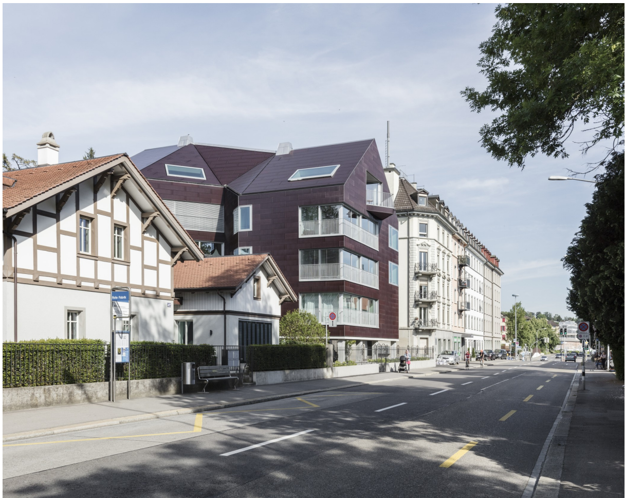
Good demonstration projects, such as this building in Zurich with an active facade, are needed in order to enthuse the population about photovoltaic systems on buildings.

Solar cells with a perovskite coating are a new development that promises to allow for the considerably more efficient and cost-effective generation of electricity from sunlight. Researchers from the Zurich University of Applied Sciences (ZHAW) have investigated how sustainable the new solar cells are – from an economic, environmental and social perspective.