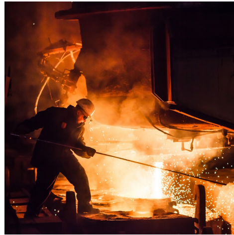
Determinants of energy-efficiency Investments

An Environmental Tax for More Innovation