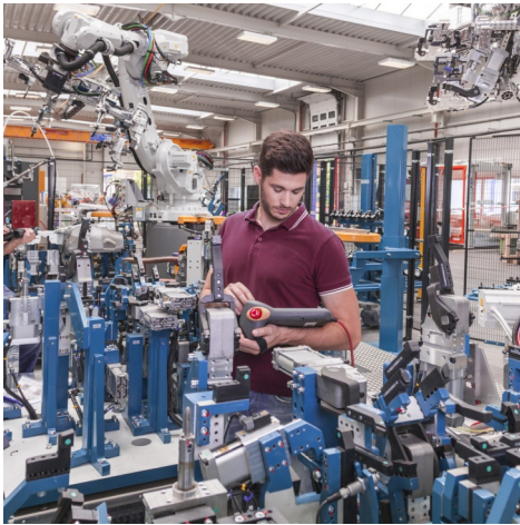
Environmental tax reform and endogenous growth

An Environmental Tax for More Innovation