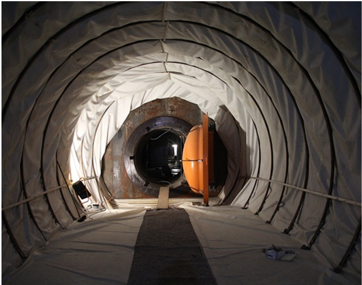
The inside of a compressed air reservoir – here, compressed air is stored in the mountain.

To store electricity from renewable energy sources, researchers from ETH Zurich, the Swiss Federal Institute of Technology Lausanne (EPFL), the University of Applied Sciences and Arts of Southern Switzerland (SUPSI), the Paul Scherrer Institute and the company ALACAES have tested a new type of compressed air reservoir in the Alps. The system is environmentally friendly. But it is still unclear whether such storage systems will turn out to be profitable.