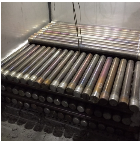
New materials for compressed air storage

Compressed air storage power stations represent efficient alternatives for electricity storage