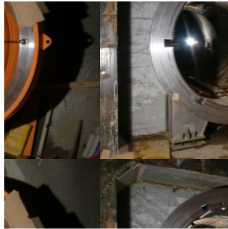
Cycles of compressed air storage

Mountain Tunnels Store Compressed Air and Heat