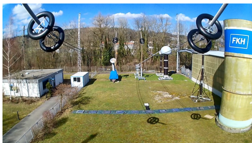
The outdoor experimental power line in Däniken (SO). Christian Franck

When the construction of power grids began over a hundred years ago, the required high voltages could only be achieved using alternating current, which is why, even today, most transmission lines work with the alternating current system. In the meantime, however, electrical components that can produce the required voltages using direct current have also become available. This makes high-voltage direct current transmission (HVDC) possible, a system that offers several advantages over alternating current technology: for example, HVDC can transmit more power through an existing line, and losses are lower than those associated with alternating current.