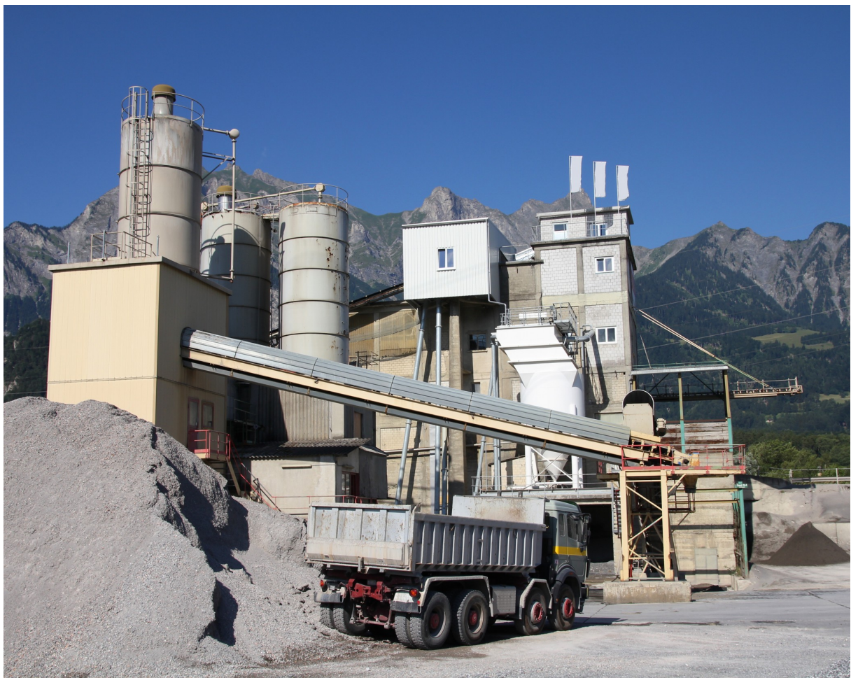
7 % of CO 2 emissions in Switzerland originate from cement production.

CO 2 can be used to produce methane gas, which in turn can be utilised for the generation of electricity or heat. Researchers from the Zurich University of Applied Sciences (ZHAW) investigated a value chain such as this as part of a joint project.