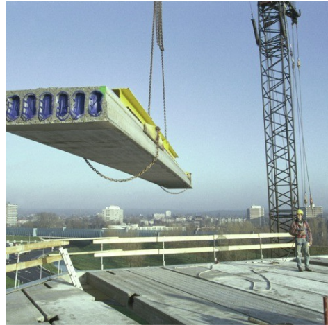
Pre-stressed carbon-fibre concrete

Beech – a miracle wood: how concrete can also be made stable without steel