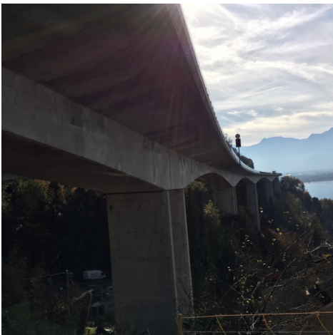
Monitoring of concrete constructions

Prestressed concrete with carbon fibres and little cement: an environmentally friendly variant