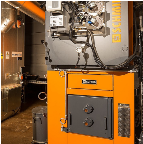
Minimising pollutants in wood combustion