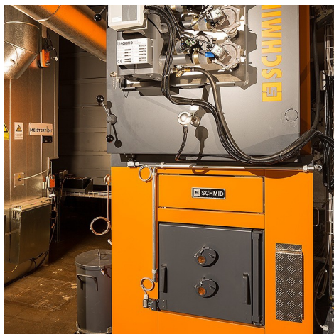
Minimising pollutants in wood combustion