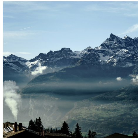
Toxicity of pollutants in wood combustion

Harmful particles in the air originating from wood stoves