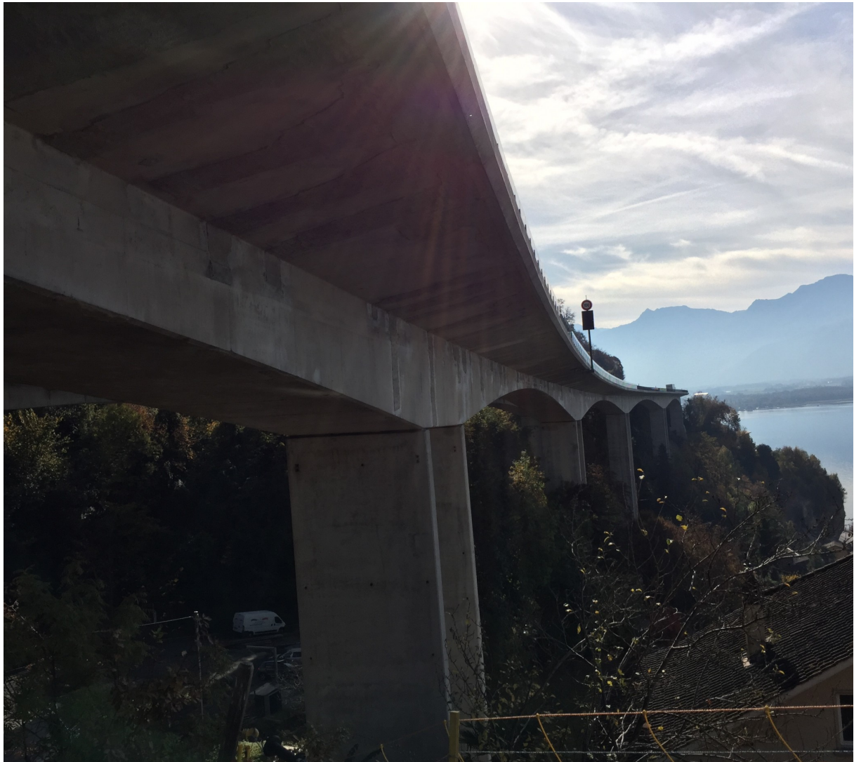
The Chillon Bridge was renovated with ultra-high-performance fibre reinforced concrete.

If buildings were monitored by sensors, they could be renovated in a more targeted manner – making them more cost-effective and environmentally friendly. Their service life could also be extended.