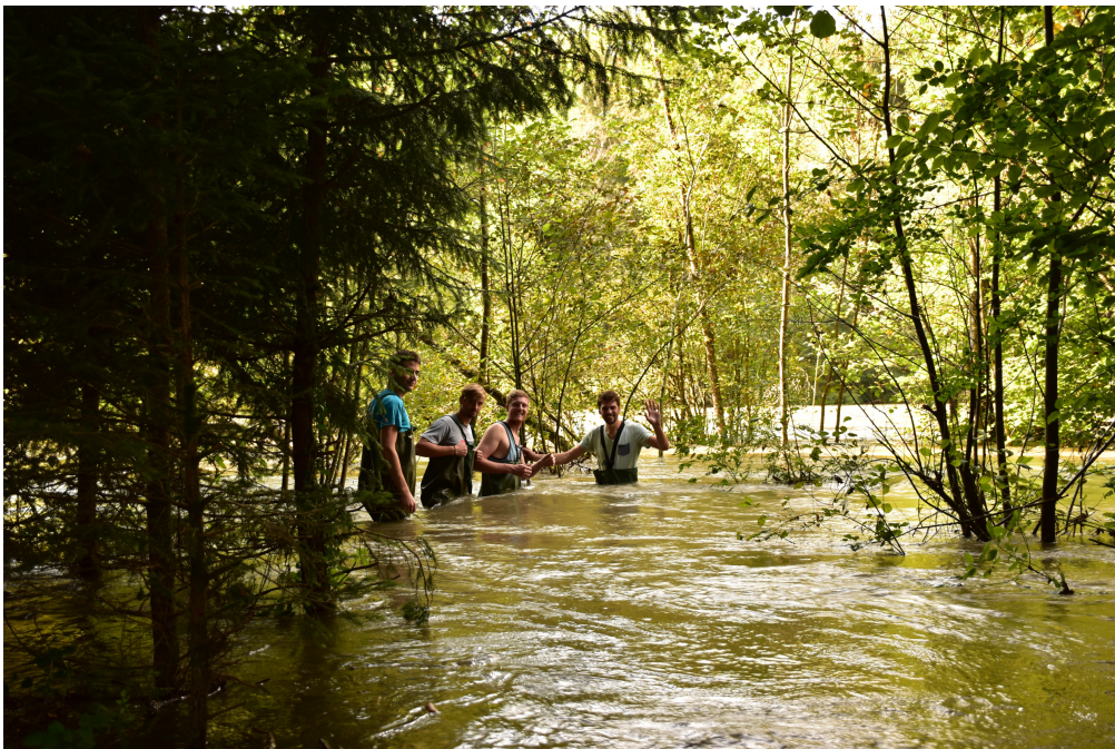
During the flood the Saane floodplain forests are under water.