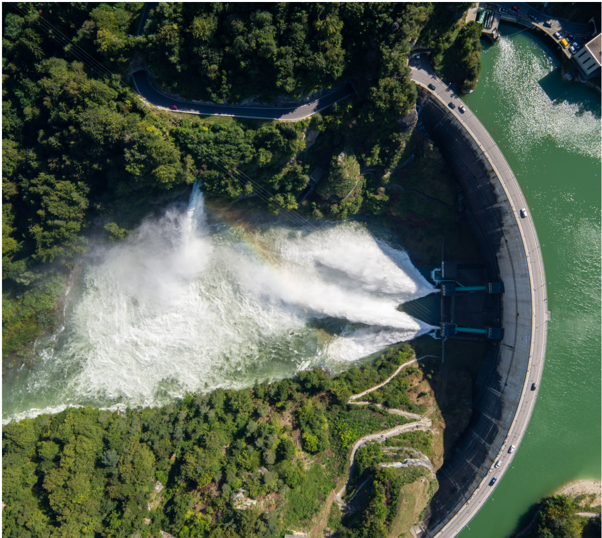
The Rossens dam creates the Lake of Gruyère.

Little water usually flows in rivers situated beneath dams, with the dam walls also interrupting the transportation of sand and gravel. As a consequence, algae increasingly becomes established on the riverbed and the river ecosystem dwindles. This research project investigated whether artificial flooding can help to counter these developments.