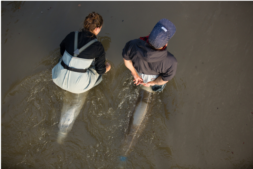
Researchers take samples in the river Forschungsgruppe Ökohydrologie, ZHAW