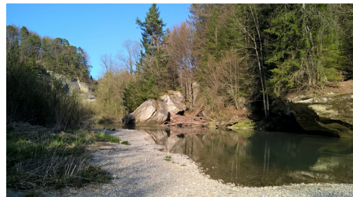
A tame river: below the Rossens dam, the Saane flows very sparsely.

This is also the case at the Rossens dam in the canton of Fribourg which dams the Saane to create the Lake of Gruyère. Below the dam, 2.5 (in winter) to 3.5 (in summer) cubic metres of water are still discharged every second – prior to the construction of the dam, the discharge rate was several times higher. In the alluvial zone, trees and shrubs are therefore sprouting on the gravel banks, while algae is growing in the shallow water. There is also a lack of bedload on the riverbed due to it being held back by the dam wall. The consequence: the alluvial zone of national importance is at risk of being greatly impoverished or even disappearing.