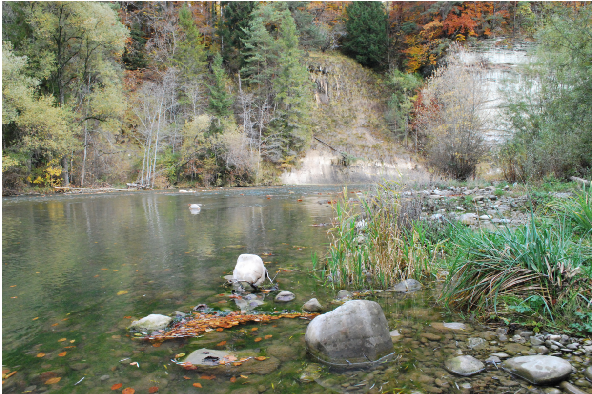
Idyllic landscape along the course of the river Saane. Forschungsgruppe Ökohydrologie ZHAW