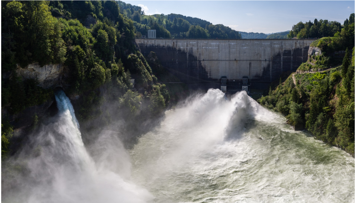
Huge fountains pour into the river.

The operators finally opened the locks in September 2016 – a total of 9.5 million cubic metres of water flowed out of the Lake of Gruyère. Result: the flood eroded the overgrown vegetation on many gravel banks and transported water to previously dried up side channels. Aquatic invertebrates that are adapted to calm waters were washed away – their numbers quickly recovered, however, as revealed by a population count two months after the flood.