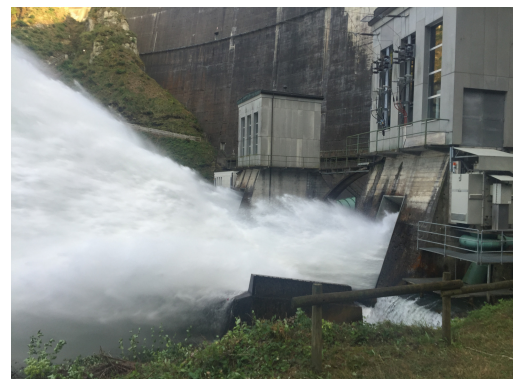
At the foot of the Rossens dam, the water shoots out of the locks.

Before the flood took place, the scientists analysed historical aerial shots, mapped a river section with drones and measurement devices on the ground and in the water, collected aquatic invertebrates as well as microbes and used special cameras to obtain data on the species composition of the flora. They also created gravel deposits in the floodplain as the coarse material that is naturally transported by a river is unable to pass the dam wall. Furthermore, they installed small transmitters in almost 500 rocks in order to measure how far they were transported by the water.