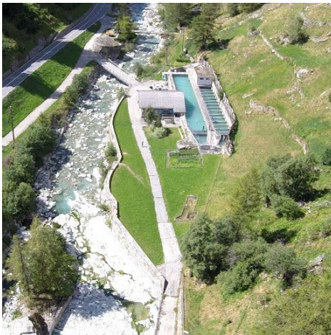
Sediments in high-head hydropower plants

Tiny Particles Threaten Hydroelectric Turbines