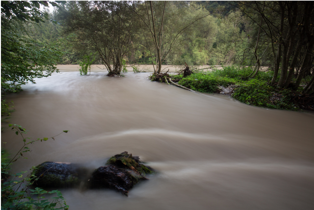
The long exposure shows how the water pours through the forest. Forschungsgruppe Ökohydrologie, ZHAW