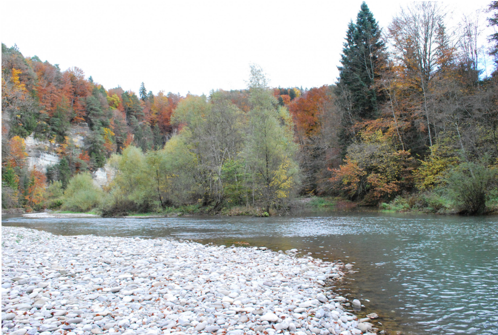
The Saane in autumn. Forschungsgruppe Ökohydrologie, ZHAW