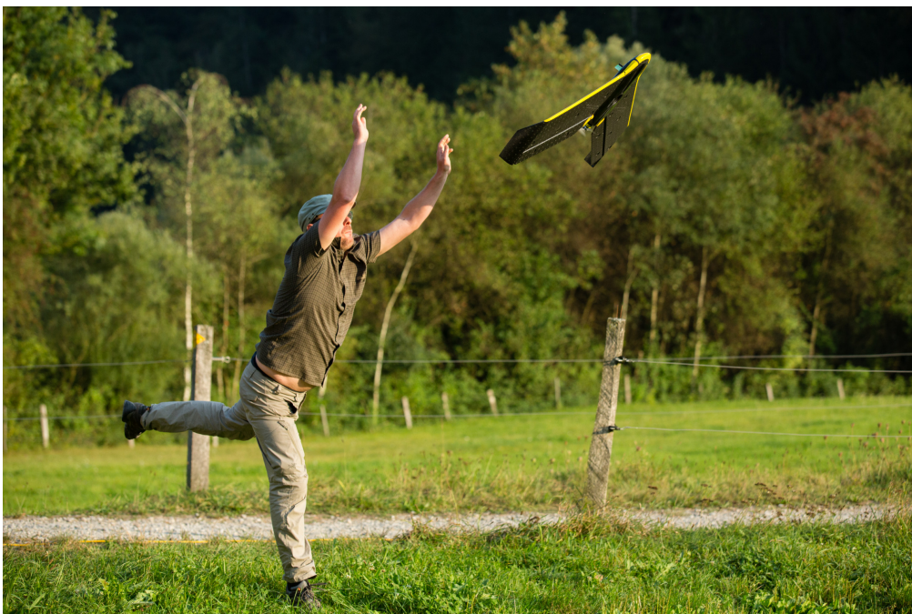
Launch of a research drone. Forschungsgruppe Ökohydrologie, ZHAW