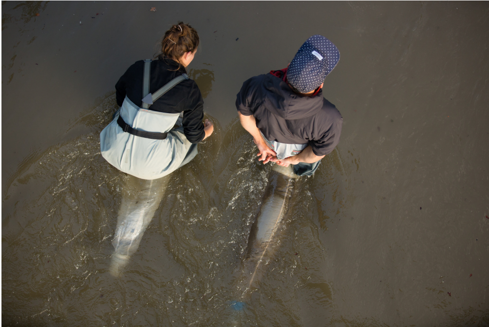
Researchers take samples in the river Forschungsgruppe Ökohydrologie, ZHAW