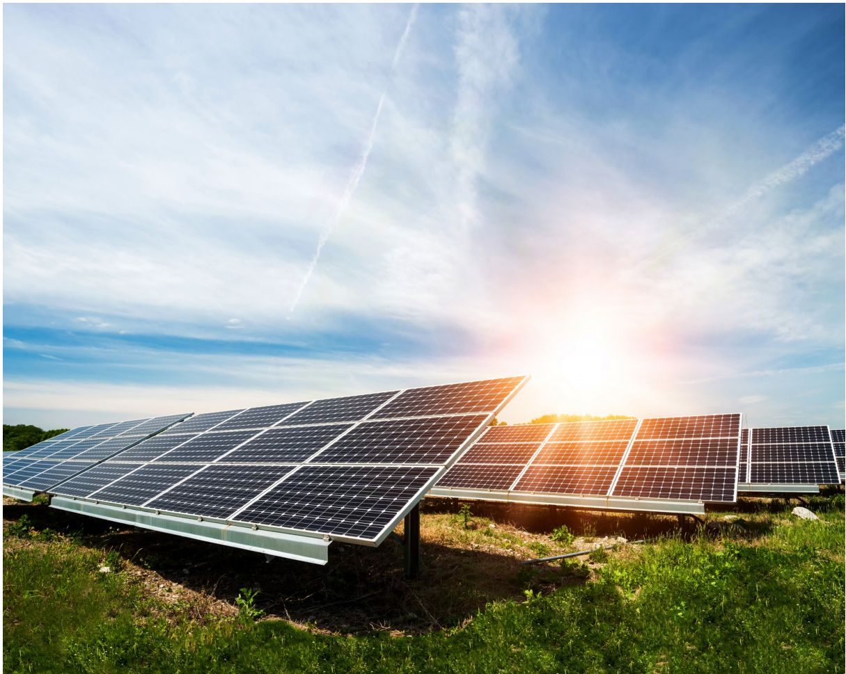
The expansion of solar energy poses the system with challenges.

While nuclear energy is being phased out, wind energy, hydropower and solar electricity are gathering momentum. Can the Swiss electricity market manage the resulting changes?